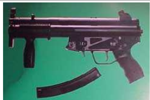
Daisy Model 15 replica of the German-made police weapon