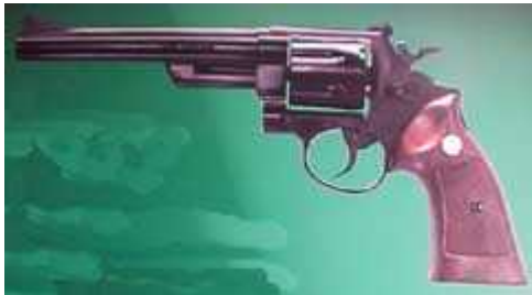
Daisy Model 04 replica of the classic .44 Magnum