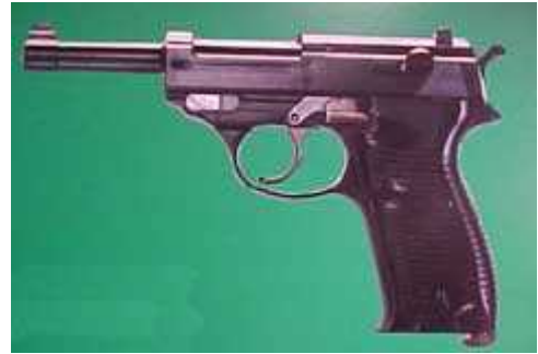
Daisy Model 38 replica of the semiautomatic side arm issued to officers of the German Wehrmacht during World War II.