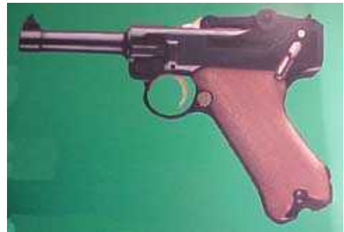
Daisy Model 08 replica of the famous German 9mm semiautomatic pistol used during both World Wars I and II.