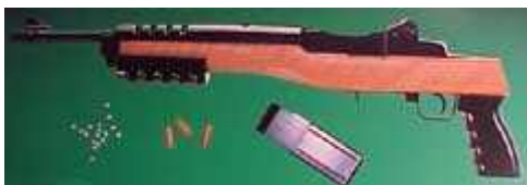
Daisy Model 14 replica of the famous semiautomatic rifle