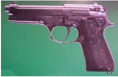
Daisy Model 09 replica of the official 9mm semiautomatic side arm of the U.S. Armed Forces.