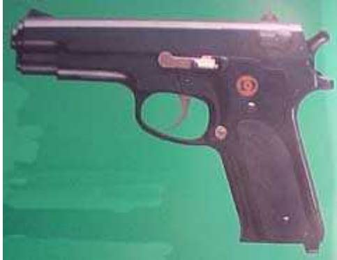
Daisy Model 59 replica of one of the most acclaimed double-action 9mm automatic pistols of America.