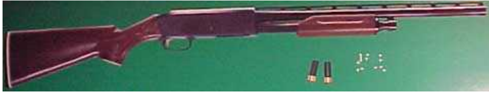
Daisy Model 870 replica of the popular Remington 870 "Wingmaster"