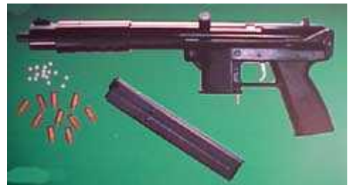
Daisy Model 12 replica of the widely used international Paramilitary semiautomatic defense weapon.